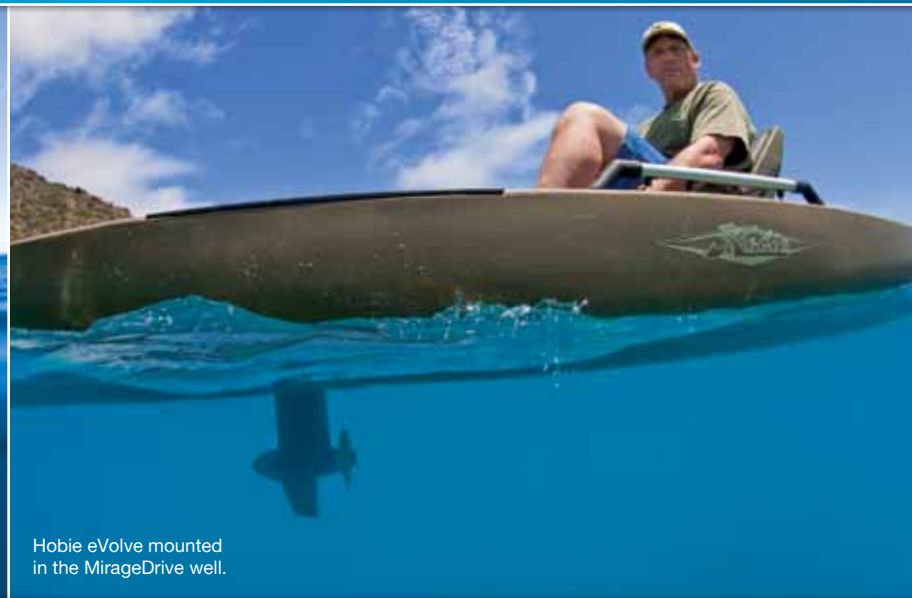
Hobie eVolve mounted in the MirageDrive well.