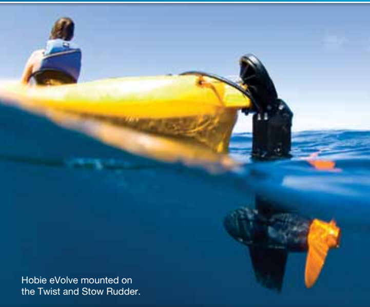
Hobie eVolve mounted on the Twist and Stow Rudder.

Add the power of the Hobie eVolve to your kayak and expand your horizons.