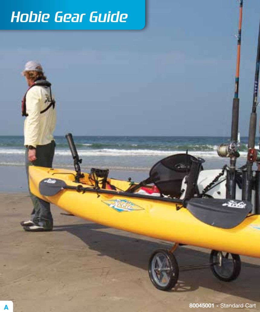
80045001 - Standard Cart