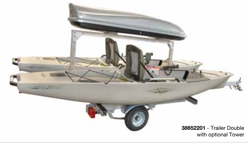
38652201 - Trailer Double with optional Tower