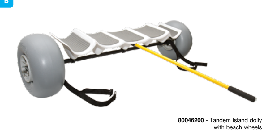
80046200 - Tandem Island dolly with beach wheels